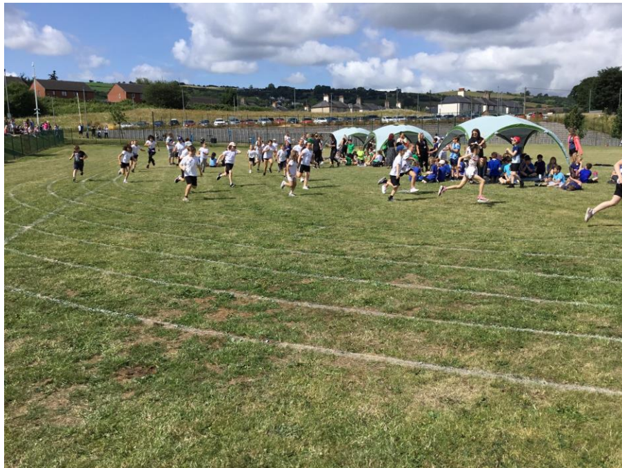
Da lawn to Coeden house in the Infants who won overall!