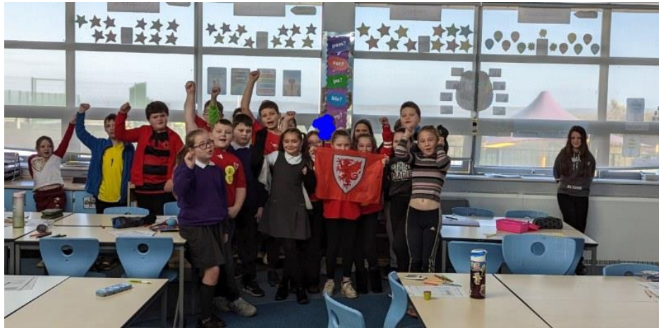
Bedwen enjoyed watching the Wales match, we have also been making planets for our solar system