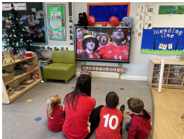
Owls class also enjoying the Wales game, and singing the National anthem.