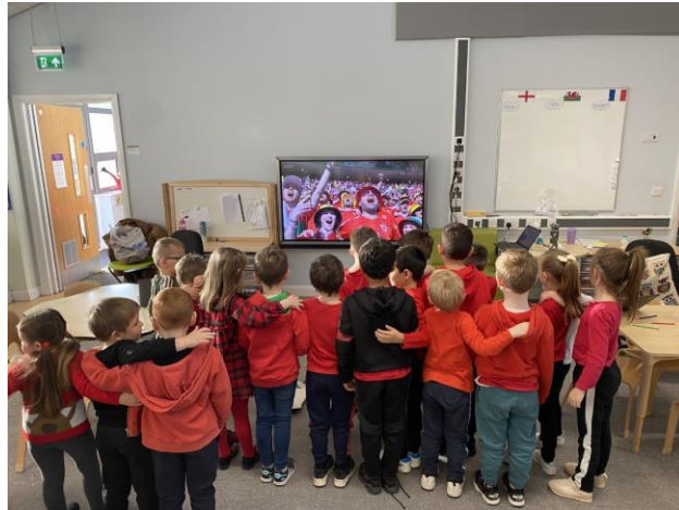
Llwyfen supporting Wales.